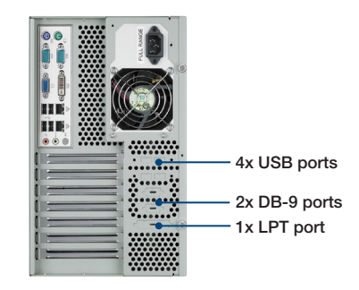
Easy-to-maintain cooling fan